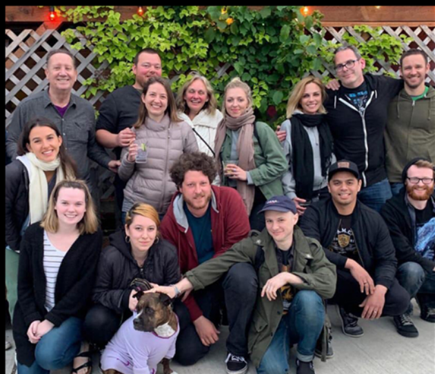
Wrap party for the feature Martingale in May 2019