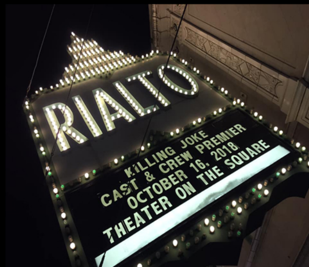
The Cast & Crew Premier of Killing Joke at the Rialto/Pantages Theater in Tacoma, WA