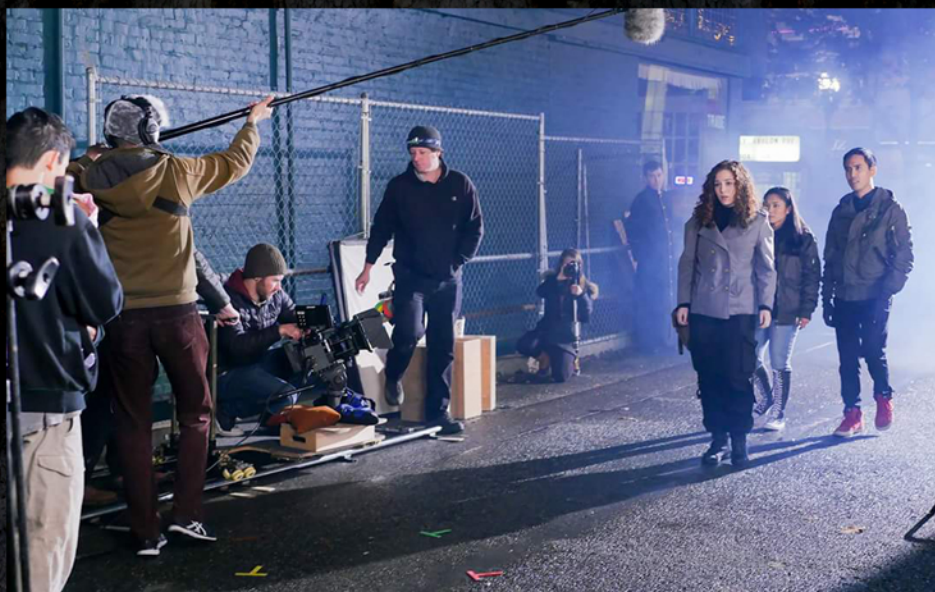
Adventus Films on the production of the TV show Tabitha: Witch Of The Order